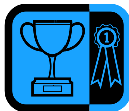
Rosette for New Title