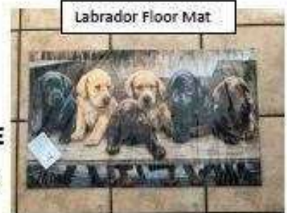
Labrador Floor Mat