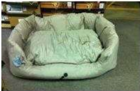
Rogz Dog Bed – lab sized, made of rip-stop nylon